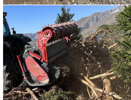
☑ YouTube www.youtube.com/seppimulcher